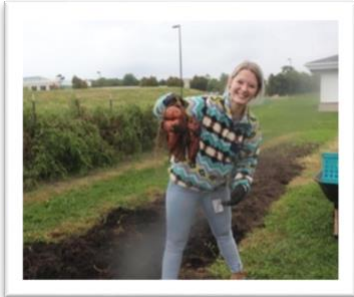
Intern working on a farm

Iowa State University's 25-week, distance dietetic internship supports up to 20 interns in Iowa and up to 60 additional interns across the nation (80 interns per cohort). The program supports two cohorts each year – one running January to July and another running June through November – totaling up to 160 interns per year. Because interns complete their supervised practice rotations asynchronously, the activities were woven throughout the internship.