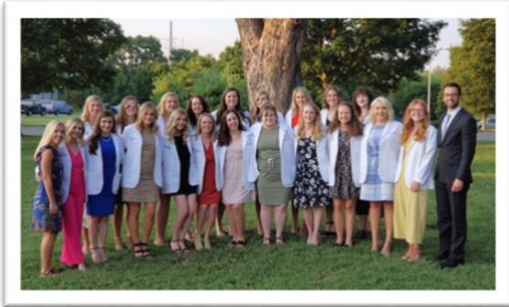
UK coordinated program and dietetic internship students at graduation

The University of Kentucky offers two options for students to complete a supervised practice in dietetics: an undergraduate coordinated program and a stand-alone dietetic internship . The supervised practice components of both programs are 7 months in length, beginning in January and concluding in August, and offer 20 interns with rotations across Kentucky in addition to 21 -credit hours of coursework.