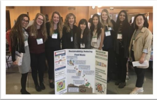
OHSU students present about policies to reduce food waste

The Oregon Health & Science University program is centered in Portland, Oregon with 23 interns – 18 interns completing rotations in Portland, 2 in Bend, and 3 in Medford, OR. In addition to a stand-alone dietetic internship , the program also offers a combined Master of Science in Human Nutrition and dietetic internship (MS/DI).